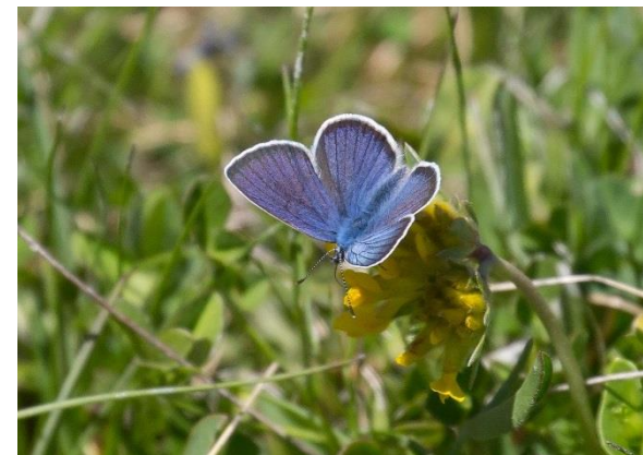
From top: Snowfinch, Matterhorn & Mazarine Blue