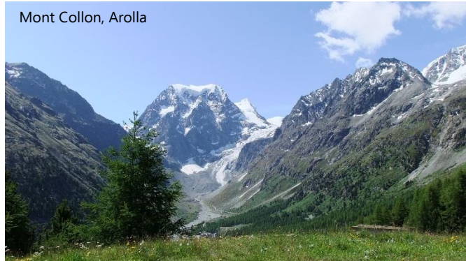
Mont Collon, Arolla

The picturesque town of Evolène sits in the Val d'Hérens and will be our base for this relaxed week-long holiday. We take daily excursions enjoying some spectacular birding, beautiful butterflies and the most panoramic landscapes in Switzerland. Locally, we enjoy the Val d'Hérens, which as a Parc Regional and a Biosphere Reserve is managed using traditional methods and without chemicals, taking short drives for